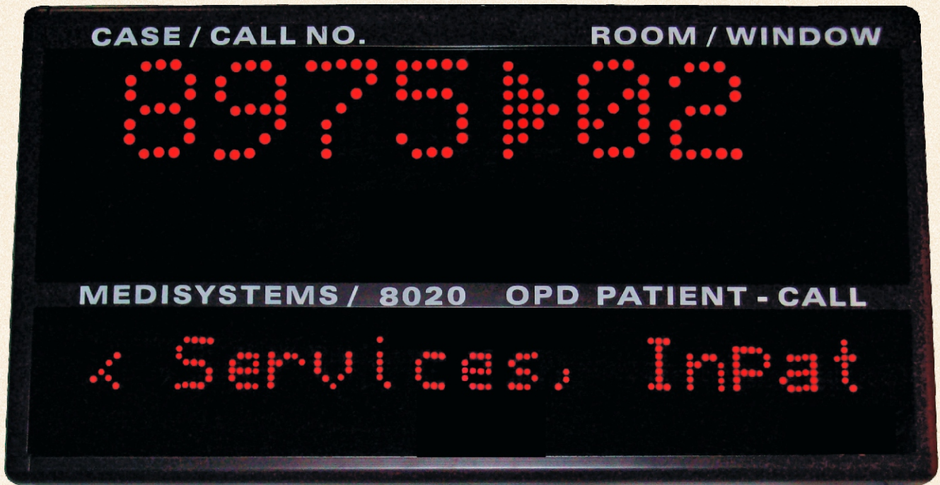
Main Display Unit