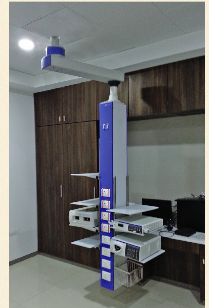
Single Arm Pendant

M edisystems OT Pendants are fabricated in pure Stainless Steel and Aluminium. They are available in Rigid or Rotating versions in Shell or Shelf configurations. All electricals are protected and wired in sealed and fail-safe mode. Medical gas outlet arrangements are customised to user's choice.