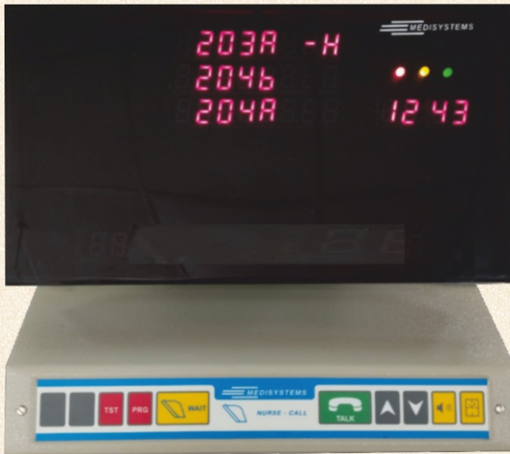
Central Display Unit