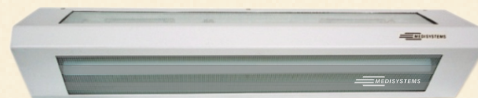
Patient - Bed Lamp

R outine add-ons include patient-bed lamps available in two and three feet lengths along with panel mounted switching.