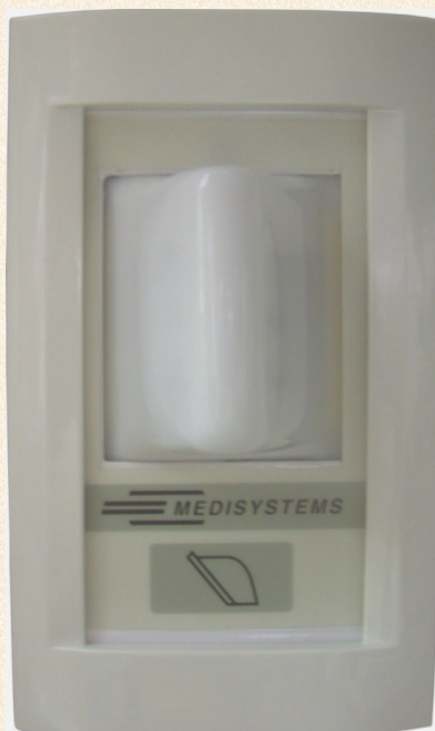
Door Display Unit

M edisystems Electronic Nurse-Call Systems employ the latest technologies to deliver a number of useful features : Call Acknowledgment, Call Reminder, Nurse Presence Registration, Emergency Alerts, Nurse Help Requests, Instrument Alarm Relay, I-V Drip Alert, Hospital-Wide Code-Blue Alert, SMS Alert, Patient-Nurse Intercom, Corridor Displays, Call Transfer, Attendant Call, Configured Handsets offering linkage with Lighting, Audio and TV facilities, System Diagnostics and Nurse-Call Response Monitoring. These systems are available in several models and can be configured for every kind of hospital.