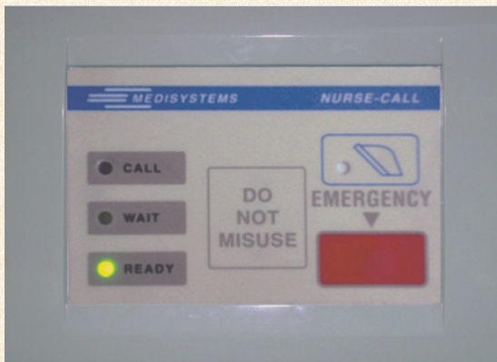
Emergency Toilet Unit