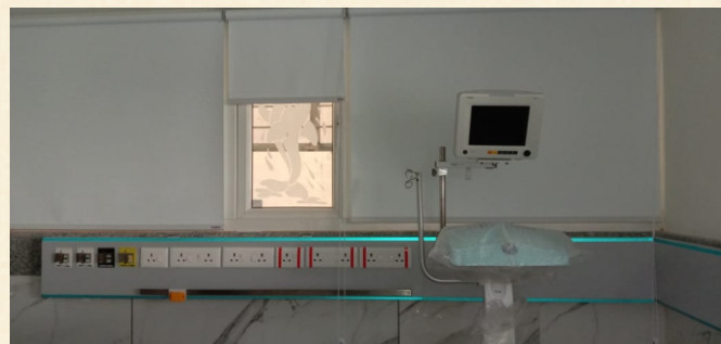
Horizontal Running Panels