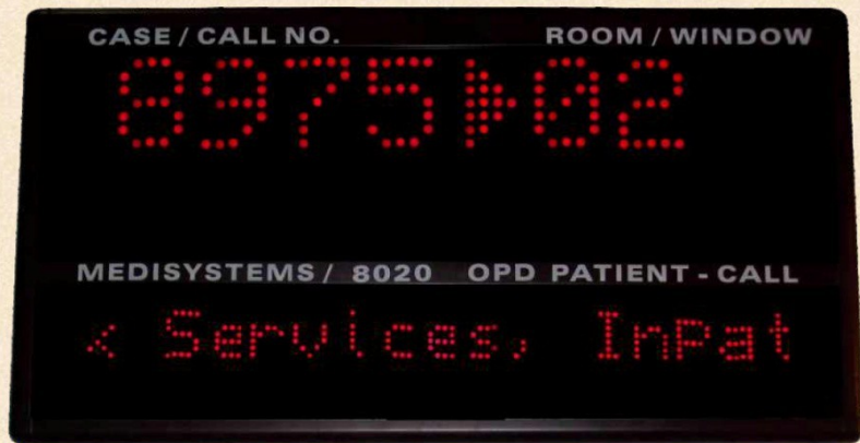
Main Display Unit